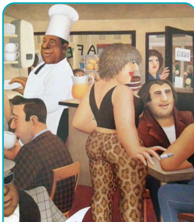
Café in Los Angeles . Sold at auction in 2019 for £28,000. Insurance value would be £58,000.

Her playful yet generous vision of humanity remains impactful—and more relevant now as institutions reevaluate the power of “popular” art to reflect and empower everyday life. Thanks to a late blooming passion and unfiltered eye for life's quirks, Beryl Cook turned vibrant, affectionate snapshots of ordinary people into a truly celebratory art legacy.