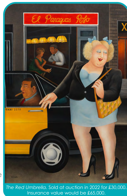
The Red Umbrella . Sold at auction in 2022 for £30,000. Insurance value would be £65,000.

Cook captured ordinary people enjoying themselves with empathy and vivacity. Her work transcends class and culture by focusing on universal themes of camaraderie, celebration, and everyday joy. Despite being largely ignored by the art establishment in her day, her legacy continues through exhibitions, reproductions, and cultural reappraisals that stretch beyond the UK.