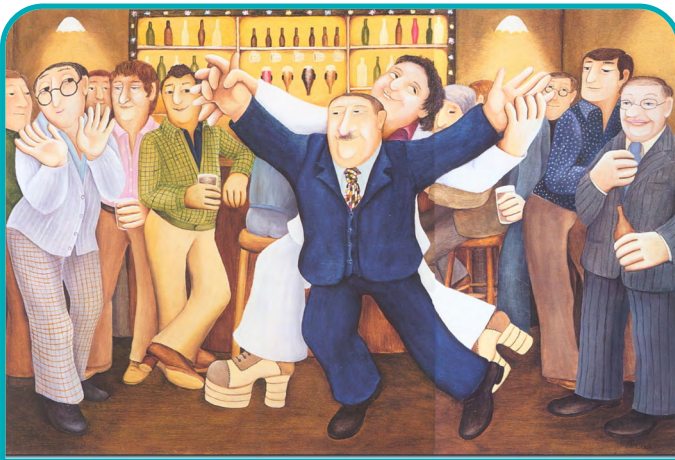
Tom Dancing . Sold at auction in 2007 for £24,000. Insurance value would be around £50,000.

In the Pantheon of popular British artists of the 20th century in which I include Helen Bradley and L S Lowry, Beryl Cook (1926–2008) stands out for so many reasons. Not only because despite being entirely self taught, she was a commercially savvy and successful artist, but also for her vibrant and humorous approach to her subject matter. She painted ordinary people like you and me or others we know and love, having fun with friends and family and living their best lives.