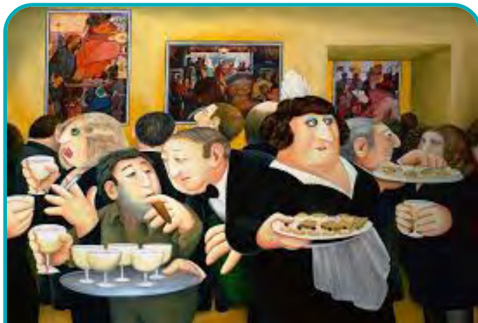
Private View . Sold at auction in 2002 for £19,000. Insurance value would be £45,000.

Many of us may be quite familiar with her style without realising it, her work is published widely and once seen is instantly recognisable afterwards with her exaggerated, rounded figures, painted in bold and bright oil colours, scenes of everyday social life—pubs, clubs, hen nights, weddings, parties, holidays—all convey a familiar warmth, humour, and humanity. Described playfully by comedian Victoria Wood as “Rubens with jokes,” her work mixes generous forms with playful satire, celebrating life through accessible, often cheekily amusing compositions.