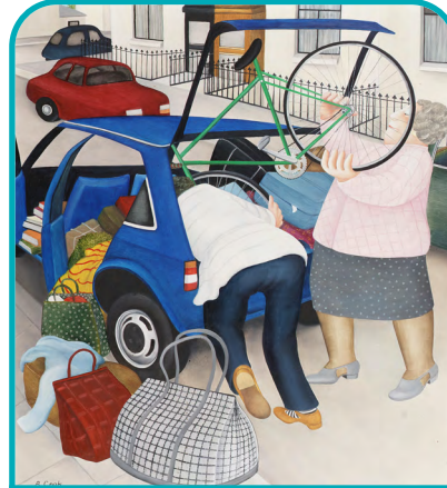
'Packing the car' . Sold at auction in 2004 for £18,000. Insurance value would be £40,000.

Her first exhibition in 1975 at Plymouth Arts Centre was a breakout success, boosted by features in the Sunday Times Magazine and leading to continuous exhibitions at London's Portal Gallery spanning 32 years. In the early