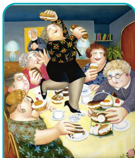
The Vicar's Tea Party . Sold at auction in 2008 for £25,500. Insurance value would be £65,000.

International exposure came later, with two major US exhibitions in New York and LA under the title Beryl Cook Takes New York/L.A. , bringing her colourful subjects illustrating her view of life and people in LA and New York.