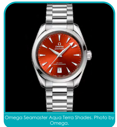
Omega Seamaster Aqua Terra Shades.

We couldn't talk about the watches of this year without mentioning an Omega, a genuinely brilliant brand with all the performance, all the technology, and all the style of its main competitor, just without the Instagram tags and mugging statistics. The 'Day of The Jackal' star arrived in a suitably smart cream suit, which really should have been accompanied by a nice cravat – but alas. With a red dial, this Omega steps away from its conservative approach but still gives a nice subtle vibe. As with most Omega watches, you can actually buy this one – with a price of £7,000, it's not cheap but a lovely thing that will match your strawberries – if you would risk it in a suit that colour.