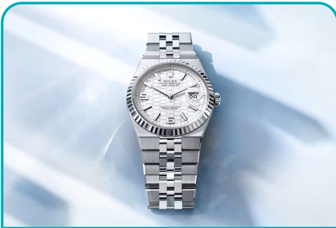
The Rolex Land Dweller.