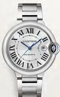
The Princess of Wales wore a Cartier Ballon Bleu watch.

The Ballon Bleu is quickly becoming her fashion staple, and why not – it's the perfect size at 33mm and has all the traits of style and understated elegance. Currently retailing for around £6,000, it's a great