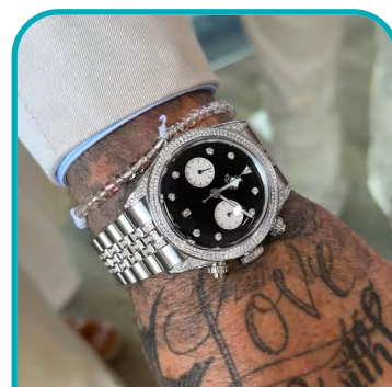
David Beckham wore his unique Black Bay Chrono with a black lacquer dial, diamond indices, and case, bezel, and bracelet set with round diamonds.

Possibly the most talked about watch of this year was an item given as a present from Tudor to celebrate Sir (can we say that yet?) Dave's 50th birthday. It's a dramatic piece with enough diamonds for a royal tiara, but still, in a David Beckham way has a little bit of subtlety to it. You can't buy one, so any figure would be hypothetical but given its provenance it's going to be insured for north of £200,000.