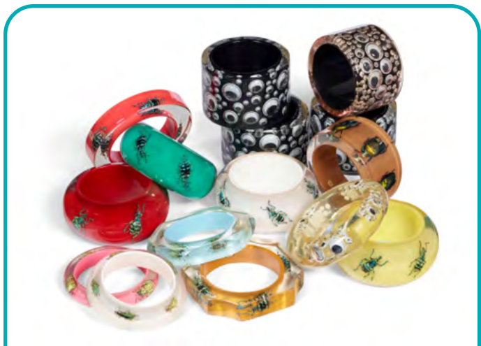
Lot 14 - A GROUP OF MULTICOLOR LUCITE BANGLES

The top-selling lot for the jewellery was this wonderful selection of turquoise, lucite and resin costume jewellery. Featuring an Alexis Bittar bangle, Jianhui London necklaces and bracelet, Rara Avis bracelets, blue hardstone studded lucite cuffs and bangle among others, this beautiful collection sold