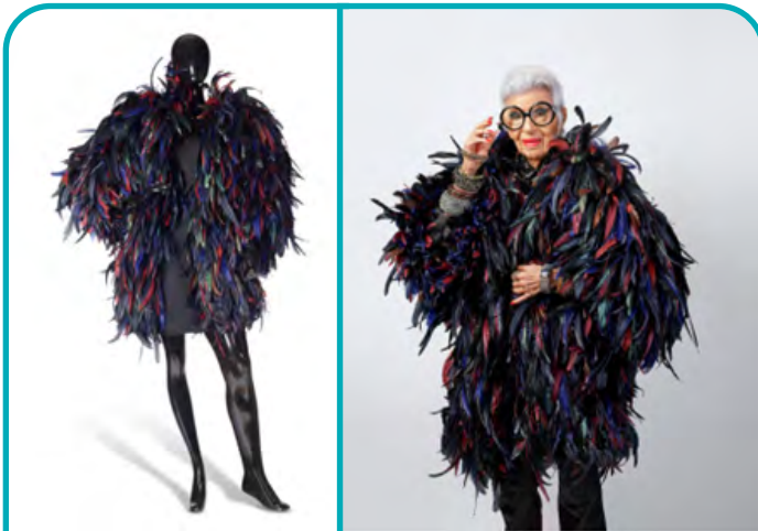
Lot 51: A MULTICOLOR FEATHER COAT LABELED DIOR HAUTE COUTURE, PARIS, 21ST CENTURY

Designer garments by Carolina Herrera, Balenciaga, Dries Van Noten, Moschino, Christian Dior, Alice & Olivia, Valentino, Prada, Jean Paul Gautier, Iris Apfel x H&M and countless other designers were offered with estimates from $100-200 to $1,200-1,800.