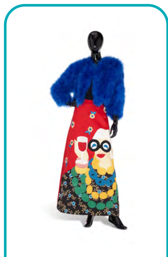
Lot 38: A RED SATIN AND MULTICOLOR SEQUIN-ADORNED 'IRIS' SKIRT LABELED ALICE + OLIVIA BY STACEY BENDET, 2018