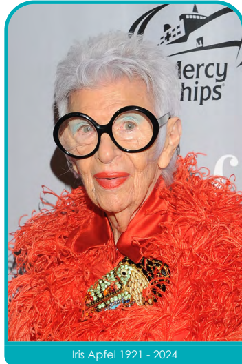
Iris Apfel 1921 - 2024

Highly anticipated, Christie's Sale of Iris Apfel's collection took place as a timed auction from New York, running from 28th January until 13th February. The sale included 220 lots from the late 'Matriarch of Maximalism's' personal collection across fashion, furnishings, textiles, accessories and of course, jewellery.