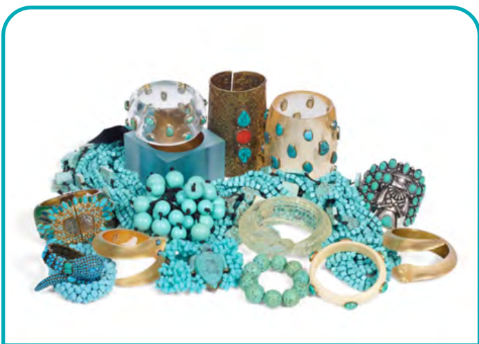
Lot 158 - A MIXED GROUP OF TURQUOISE COLORED JEWELRY IN LUCITE, RESIN AND SILVERED METAL

Another layer of Apfel's iconic style was of course her jewellery. This sale featured sixteen lots of jewellery, all beautifully bold and eye-catching! Group lots of brightly coloured lucite bangles, costume jewellery acquired from travels to Eastern Europe, the Middle East, China and the Hindu Kush region, beaded necklaces, rhinestone suites, and Southwestern American jewels were all a part of this spectacular offering of stylish jewellery.