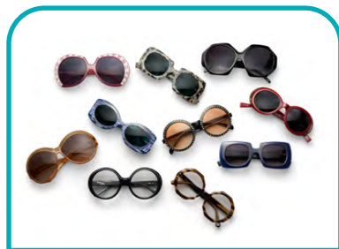
Lot 48 - TEN PAIRS OF EYEWEAR, VARIOUS DESIGNERS, INCLUDING CHRISTIAN DIOR, EMILIO PUCCI, LATE 20TH/21ST CENTURY

Another lot that was unsurprisingly popular was lot 48, ten pairs of eyewear. Only two days into the sale the bidding was at $3,500 against a modest $200-300 estimate, and bidding concluded at an incredible $16,380.