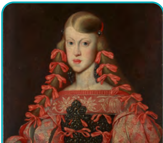
Lot 85: SPANISH SCHOOL, 17TH CENTURY Portrait of Margarita Teresa (1651-1673), Infanta of Spain, and later Holy Roman Empress, Queen Consort of Germany Hungary and Bohemia, Archduchess Consort of Austria, in a red and silver silk gown and jewel-encrusted stomacher oil on canvas, in a painted oval 27 1/8 x 20 3/4 in. (68.9 x 52.7 cm.) $1,500-2,000. Sold for $17,640.

The back and seat in scallop-shell form, the arms modeled as dolphins raised on shell-form legs, the back legs on each example attached backwards 40 in. (101.5 cm) high, overall.