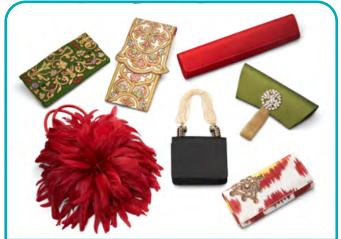
Lot 209 - SEVEN EVENING BAGS LABELED OSCAR DE LA RENTA, CHADO RALPH RUCCI, ARTISTIC BOMBAY, THE REST UNLABELED, LATE 20TH/21ST CENTURY

Another lot of Apfel's accessories included a selection of evening bags. Including all the hallmarks of Apfel's signature style to include embroidery, bold colours, feathers and embellishments, this popular lot sold for $10,080.