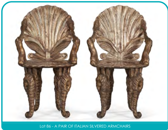
Lot 86 - A PAIR OF ITALIAN SILVERED ARMCHAIRS

carved and silvered chairs exuded sheer opulence! Estimated at $2,000-3,000, these chairs reached $8,820.