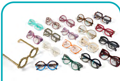
Lot 1 - A CASE OF EIGHTEEN MULTICOLOR AND PATTERN EYEGLASS FRAMES. IRIS APFEL X ZENNI, 2021-2022

It seems fitting that the lot to 'kick off' this stylish sale was a selection of eighteen pairs of glasses. In bright hues, zebra prints and heart shapes, this striking mixed lot certainly set the tone for the rest of the sale. Estimated initially at $400-600, the bids were sitting at over ten times that amount a mere few days into the two-week timed sale, and one lucky bidder secured this lot for $15,120.