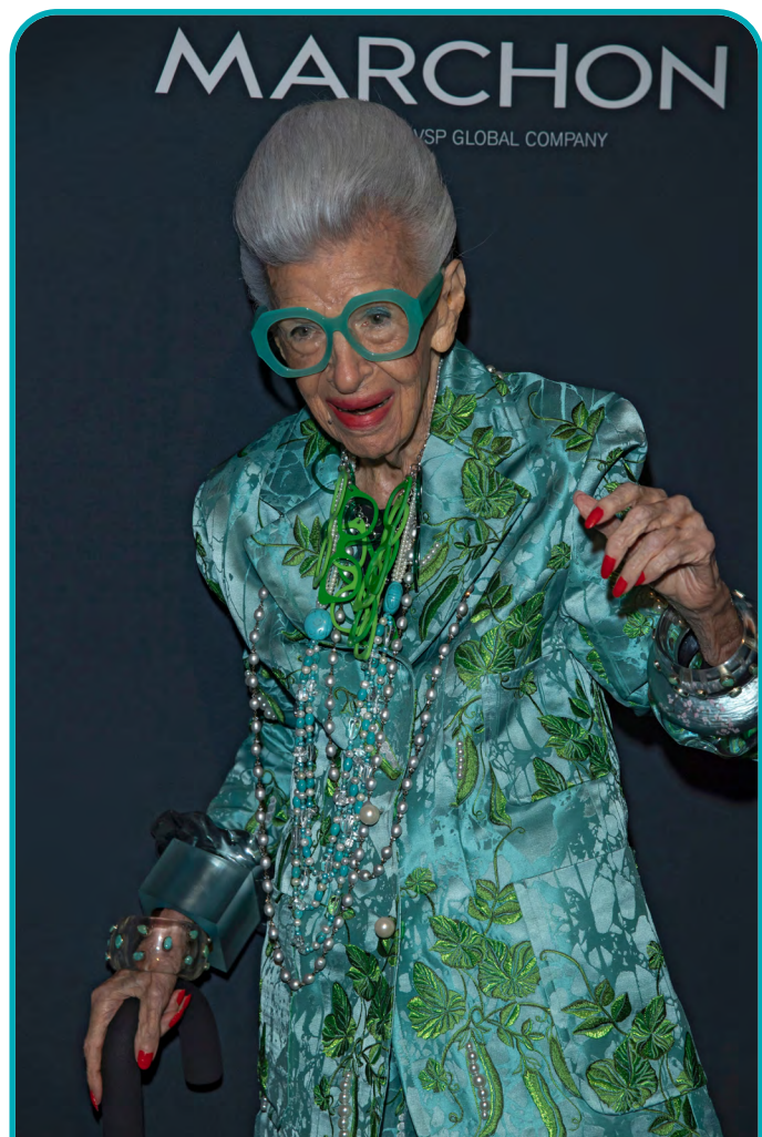
Iris Apfel attends the 2021 ACE Awards at Cipriani 42nd Street on November 02, 2021 in New York City.

for $9,450 against an estimate of $300-500. Pieces from Apfel's own line of costume jewellery Rara Avis, originally sold through the Home Shopping Network were also amongst the lots on offer. Her playful lucite bangles set with googly eyes were trademark Iris and one of the most popular designs from Rara Avis at the time. These typically retail on the secondary market between $300-400, however with the added provenance, this lot of fifteen bangles (six by Rara Avis) sold for $6,300.