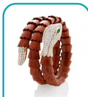
Diamond and wood snake bangle

better way to start the year and to embody those images. And for that the perfect bangle sold by Bonhams in 2020 for USD 2,800, set with 1.25 carats of diamonds, and coiled in the tradition of snake and serpent bangles found in all antique jewellery.