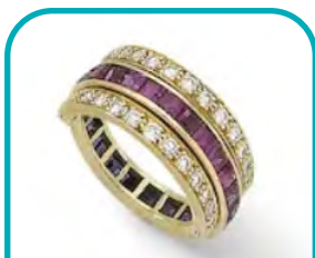
Sapphire, ruby and diamond swivel ring

curiosity if I flip from ruby to sapphire during the course of the day. A ring such as this would sell for approximately £1,000 at auction.