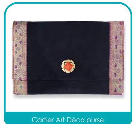
Cartier Art Déco purse

The Twelve days start on the 25th December, and it is a full day of socialising so the perfect purse for this occasion would be an Art Déco velvet and coral bag by Cartier, dating 1920s, which sold at Bonhams for £2,295.