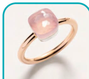
Rose quartz Pomellato ring

On the 30th, I would wear a jewel set with a restorative gem as the legends have it. This would be quartz. And who else would I wear but Pomellato who have based their