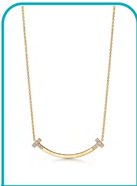
Tiffany T Smile pendant necklace

On the 2nd January I would subtly remind the people around me how they make me feel with the Tiffany T Smile pendant necklace. Retailing for £3,250 and set with under 0.20 carat of diamond, it could be seen as a costly reminder but worth every penny!