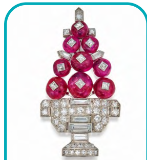
Cartier ruby and diamond brooch With approximately 2 carats of diamonds, this brooch sold for USD 47,880, with a pre-sale estimate of USD 40,000 – 60,000

With quartz' powers to energise, remove all negativity and give peace and optimism, I'm all set for New Year's Eve celebrations.