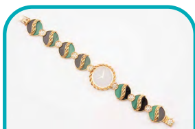
Patek Philippe 4282 This watch sold at Dawsons Auctioneers in 2022 for £14,000 against a pre-sale estimate of £2,000-3,000.

On the 28th, to remind me that time is still passing by even though it seems to have stopped for a few days, I would look down at my Patek Philippe 4282 in onyx, malachite and yellow gold with diamond highlights. A combined delight of wearing both an exceptional timepiece and quality jewellery.