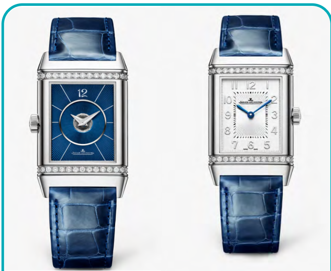
Jaeger LeCoultre Reverso Classic Duetto

These are the jewels I would wear for 12 consecutive days after Christmas. I never said it was going to be a cheap Christmas... Wishing you Best Wishes for the New Year.