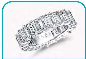
Graff diamond ring

Finally, as a reminder of the good and bad times, those past and to come, I would choose to wear a diamond eternity ring as I start the new year at work. As a symbol of the circle of life, the unbreakable bonds that make us who we are, and the diamonds' sparkles representing an echo of life's dazzling surprises. Graff's Emerald Cut diamond ring retails for £60,500 and is set with 7.60 carats of diamonds, that's a lot of dazzling!