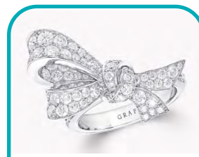
Tilda Bow diamond ring by Graff

On the 31st, I would wear the present I found under the Christmas tree. And just like it was beautifully wrapped, it too looks like a present: the Tilda Bow diamond ring by Graff. With a little over 2 carats of diamonds, it retails for £13,000 and would be the gift that keeps on giving every time you would glance at it!