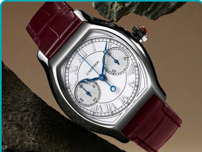
Cartier's First Ever Chronograph

French for 'Turtle,' the Cartier Tortue gets its name from its distinctive tortoise shell shaped case. The Tortue was Cartier's third ever watch case design, predating even the ever-popular Tank. Louis Cartier had just introduced the Santos-Dumont in 1904 and the Tonneau in 1906 when he designed the Tortue in 1912.