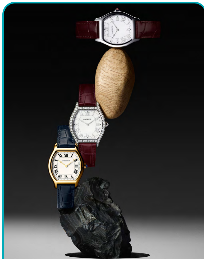
The new 2024 Privé Tortue collection

Re-imagined and launched at this year's Watches & Wonders, the 2024 Privé Tortue is the eighth instalment in Cartier's latest Privé collection. Celebrating 112 years since the inception of the original Cartier Tortue, the maison introduced a collection of time-only and more excitingly chronograph Privé Tortue models, each limited to 200 numbered pieces – except for a diamond and platinum monopusher (or monopousoir in French) watch limited to 50 pieces.