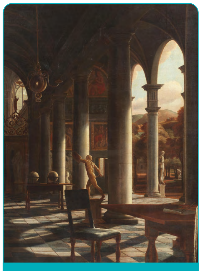
Samuel van Hoogstraten The Tuscan Gallery

The message from the week's sales is that if you have a masterpiece by an Old Master make sure the insurance value is high enough and if you have works by minor masters, check current values to make sure your premium isn't too high.