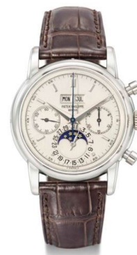
Eric Clapton's rare Patek Philippe 2499 Platinum 1987 – Christie's Geneva, Nov 12 2012, Lot 1391, $3.6 million

Call us today to enquire about an appointment on 01883 722736 or email enquiries@doerrvaluations.co.uk or visit our website www.doerrvaluations.co.uk