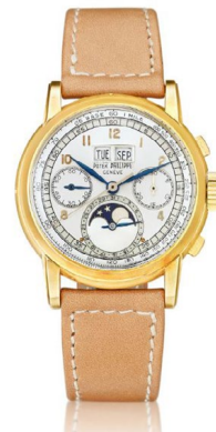
Patek Philippe Reference 2499, 1 st Series, yellow gold 1953 - Sotheby's Hong Kong, 13 Oct 2021, Lot 2262, 9,855,000 HKD

Prices for Patek Philippe ref 2499 are amongst the highest for the brand and continue to grow – a combination of their rarity, exceptional complication and place in the zeitgeist. Whether Lennon's watch does make it to auction or not, the infamy and journey of this exceptional timepiece will surely continue to bolster and uplift the value of these rare timepieces.