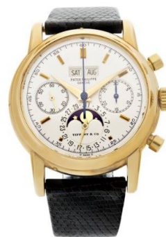
Patek Philippe 2499 4th series similar to Lennon's sold for $818,600 in 2020 at Sotheby's.