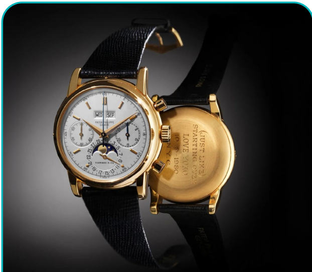
John Lennon's Patek Philippe 2499 and back inscription