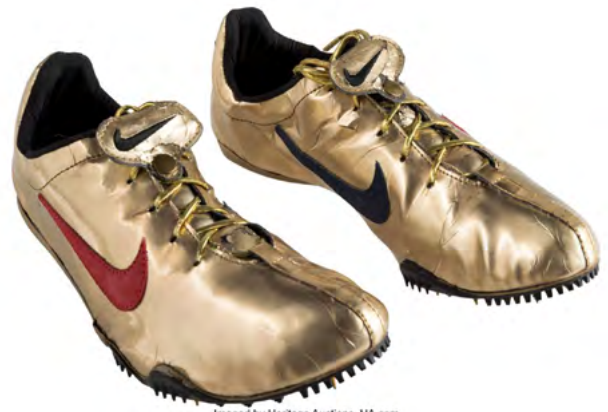
Michael Johnson Olympics-Worn Nike 'Gold Shoe' (1996). (Lot 90347, Heritage Auctions, 24 th March 2024)

Michael Johnson is one of the fastest men in history and one of the most famous names in athletics. In March 2024 auctioneers Heritage offered a pair of 'Gold' Nike running spikes worn by Michael Johnson whilst representing team USA during the Atlanta 1996 Olympic Games. Johnson achieved gold in both the Men's 200m and 400m sprint competitions – breaking World Records in the process. The stylish pair sold for $68,750 (inc. B.P.) (Lot 90347, Treasures from Planet Hollywood, Heritage Auctions, 24 th March 2024).