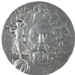
Athens 1896 Olympics Silver 'First Place' Winner's Medal (Lot 6001, Olympic Memorabilia - RR Auctions, 22 nd July 2021)

The 1896 'Games of the I Olympiad' was on a much smaller scale than that of the games today – with just 241 all male athletes competing, the majority of whom were Greek, and others from just 19 nations. For these inaugural games the winners received a silver, rather than a gold medal.