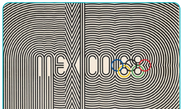
Mexico City Olympics, 1968 (Lot 3603, Vintage Posters, Antikbar, 3 rd August 2019)

The 1968 Mexico City poster was similarly striking. Inspired by Op-art the design was a collaboration between Lance Wyman, Eduardo Terrazas and Pedro Ramirez. Poster specialists Antikbar sold a copy in August 2019 – reaching £3,400 (hammer, excluding BP) (Lot 3603, Vintage Posters, Antikbar, 3 rd August 2019).