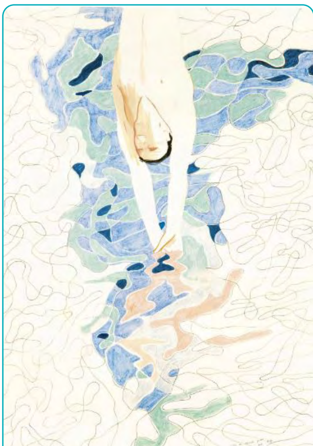
David Hockney, partially completed pencil design for 1972 Munich Games poster (Lot 174, Sotheby's London, June 2012)

David Hockney (b. 1937) designed posters for both the 1972 Munich Games and 1984 Los Angeles Games. In June 2012, Sotheby's offered Hockney's partially completed pencil design for the 1972 poster, featuring a diver – the work eventually sold for £169,250 (total including BP). The final poster often appears at auction and is part of a set created by several artists for the Munich games. In March 2024 an example of 'The Diver' poster was offered at Forum Auctions reaching a hammer price of £600 (Lot 61, Editions, Forum Auctions, 12 March 2024). Also, during the same month Bonhams London sold Hockney signed limited edition print of the 1984 Los Angeles swimming pool design for £11,250 (Lot 26, Bonhams, 26 th March 2024).