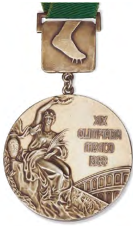
Bob Beamon's 1968 Olympic Gold Medal (Lot 11, Christie's, February 2024)

Basketball legend Michael Jordan, is one of the most famous sportsmen in history. In June 2023 Sotheby's offered the Reebok jacket worn by Jordan whilst receiving his 1992 Olympic Gold Winners Medal alongside his USA teammates dubbed 'The Dream Team'. The performance of 'The Dream Team' during the Barcelona games is one of the most influential in Olympic history. The Reebok jacket controversial, due to Michael Jordan's famous association with the Nike brand. This important piece of memorabilia was signed by Jordan and offered with an estimate of $1m – $3m. The garment achieved a sales total of just over $1,500,000 (Lot 1, The Dream Team, Sotheby's, 29 th June 2023). While his signed and worn Nike 'Air Jordan VII' sneakers also used during the 1992 Olympics sold for $114,300 (Lot 2 as before) (inc. BP).