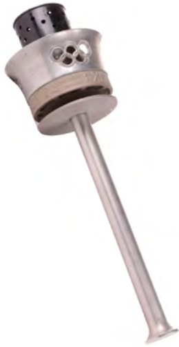
An original torch from the 1948 London Olympiad (Lot 257, Dawsons, 28 th September 2023)

In September 2023, one of these aluminium torches designed by Ralph Lavers (1907-1969) reached a hammer price of £3,000 at Dawsons Auctioneers (Lot 257, Dawsons, 28 th September 2023). Torches of similar design were used during the 1950s. In November 2022 Welsh auctioneers Anthemion sold a bearers-torch from the 1956 Melbourne Olympics – the hammer fell this time at £5,500 (Lot 724, Anthemion Auctions, 23 rd November 2022).