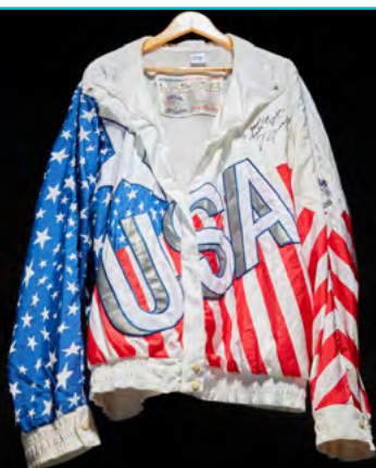
Michael Jordan 1992 Summer Olympics 'Dream Team' Signed Reebok Jacket (Lot 1, The Dream Team, Sotheby's, 29 th June 2023)

Basketball legend Michael Jordan, is one of the most famous sportsmen in history. In June 2023 Sotheby's offered the Reebok jacket worn by Jordan whilst receiving his 1992 Olympic Gold Winners Medal alongside his USA teammates dubbed 'The Dream Team'. The performance of 'The Dream Team' during the Barcelona games is one of the most influential in Olympic history. The Reebok jacket controversial, due to Michael Jordan's famous association with the Nike brand. This important piece of memorabilia was signed by Jordan and offered with an estimate of $1m – $3m. The garment achieved a sales total of just over $1,500,000 (Lot 1, The Dream Team, Sotheby's, 29 th June 2023). While his signed and worn Nike 'Air Jordan VII' sneakers also used during the 1992 Olympics sold for $114,300 (Lot 2 as before) (inc. BP).