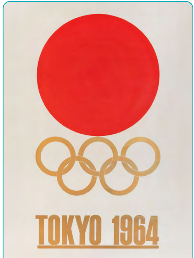
Tokyo Olympics, 1964 (Lot 0488, Potter & Potter, 29 th January 2022)

The 1964 Tokyo games were the first to produce an official set of posters designed by Yusaka Kamekura (1915-1997). The most notable of these is titled 'The Rising Sun and the Olympic Emblem' featuring simply a red circle, Olympic rings, text of the host city and year. In January 2022, Chicago based auctioneers Potter & Potter sold this lithograph poster for $1,200 (excluding buyers premium) (Lot 0488, Potter & Potter, 29 th January 2022).