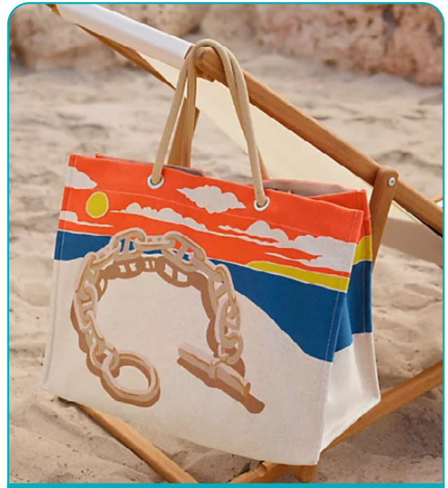
'Escale a a Plage' beach bag, designed by Matthieu Cosses

Another great example by Hermès is the 'Escale a a Plage' beach bag, designed by Matthieu Cosses, in canvas and currently retails for £1,850, a bargain when compared to the price of a Birkin and Kelly.