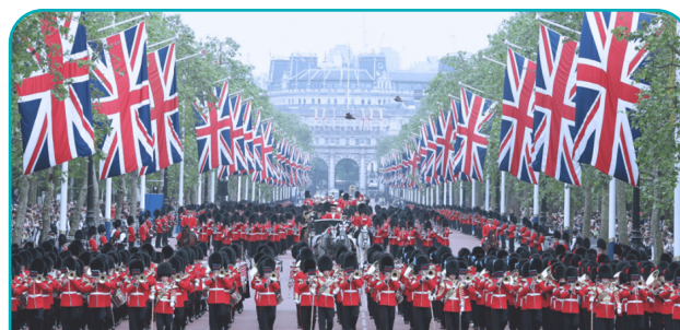
'Trooping the Colour' parade in Whitehall

The operational soldiers wear the ceremonial uniform of red tunics and bearskin hats and are inspected by the Sovereign once they reach Horse Guard's Parade in Whitehall. The parade moves from Buckingham Palace and down The Mall to Horse Guard's Parade and carries on to Whitehall.