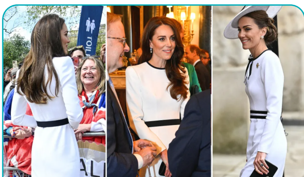
Jenny Packham dress

She wore a Jenny Packham dress, reworked from last year's coronation.