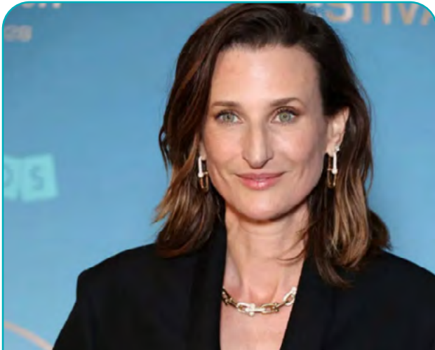
Camille Cottin

Her neck was adorned with the Tiffany HardWear Graduated Link Necklace in yellow gold and pavé diamonds. It retails for £72,500 and is set with 9.07cts of diamonds.