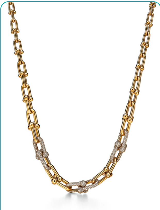
Tiffany HardWear Graduated Link Necklace

Her neck was adorned with the Tiffany HardWear Graduated Link Necklace in yellow gold and pavé diamonds. It retails for £72,500 and is set with 9.07cts of diamonds.