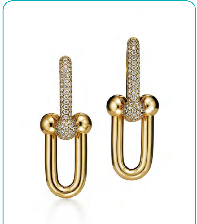
Tiffany HardWear earrings

The earrings en suite are set with 1.18cts of diamonds and retail for £15,800.