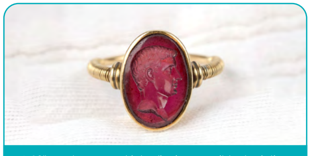
A 19<sup>th</sup> century garnet intaglio ring, possibly depicting Caesar Augustus. Thought to be one of the lost Marlborough gems. Sold at Fellows in 2023 for £90,000.

Intaglio jewellery, particularly early and crystalline gem-set pieces sold exceptionally well at auction in 2023, and continue to exponentially rise in value, so it is extremely important to ensure your items possess an up-to-date insurance valuation.