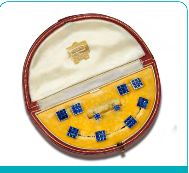
An early 20<sup>th</sup> century gentleman's sapphire dress set by Cartier, circa 1910. Set with calibre cut sapphires and within original fitted case. Sold by Bonhams in 2012 for £15,000.

Without a doubt, Cartier produced an exceptional array of fine cufflinks and dress sets from the early 20<sup>th</sup> century onwards. With an exceptional and varied output spanning decades, styles, gemstones, and featuring designs from the ostentatious to the refined, and the timeless to the novelty, these cufflinks are amongst the most sought-after at auction, with diamond-set examples selling for in excess of £52,000 (Christies, Auction 15493, 2018).