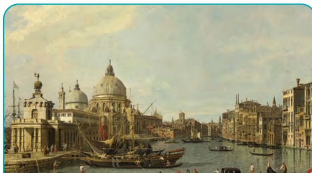
Canaletto - Venetian Views of the Grand Canal and Piazzetta

One can hardly blame consignors for not wishing to offer great paintings at auction in the current geo-political climate. These totals would have been nearly 40% lower but for an early Rembrandt of the Adoration of the Magi sold by Sotheby's to the guarantor for £9.5M and two Canalettos (1697-1768) (not a pair, but part of a set of Venetian views), sold at Christie's for £8.2M. They had never previously been published and were, therefore, 'fresh' to the market.