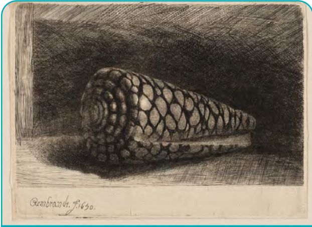
Rembrandt - The Shell

My favourite painting from all the sales was the most unusual 'The Virgin in Prayer', by the enigmatic Flemish artist, Michiel Sweerts (1618-1664).