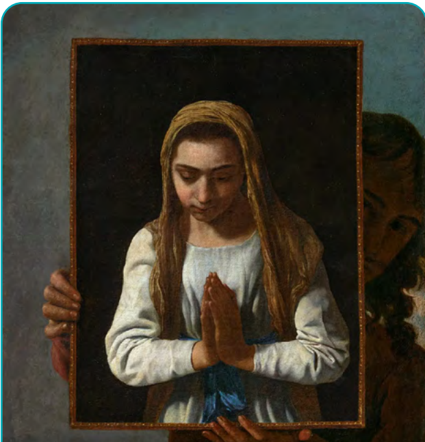
Michiel Sweerts - The Virgin in Prayer

My favourite painting from all the sales was the most unusual 'The Virgin in Prayer', by the enigmatic Flemish artist, Michiel Sweerts (1618-1664).