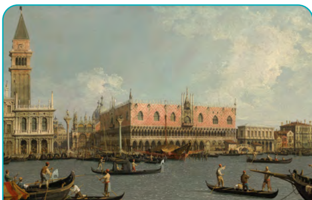
Canaletto - Venetian Views of the Ducal Palace, and St Mark's Square

Interestingly, the Rembrandt at Sotheby's, had been offered by Christie's Amsterdam, two years ago, as 'Circle of Rembrandt', with an estimate of €10-15,000. It was knocked down to the Sotheby's consignor for €860,000. So, somebody else had recognised its potential, too.