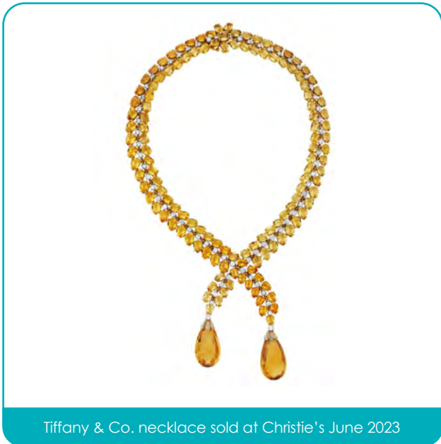
Tiffany & Co. necklace sold at Christie's June 2023

She dazzled the crowds with a 1962 gold and platinum Tiffany & Co. necklace. It is set throughout with oval, pear and briolette-cut yellow beryls and brilliant-cut diamonds. A similar piece, dating from 1967, sold in June last year, 2023, at Christie's for USD $189,000, set with approximately 86 brilliant-cut diamonds, weighing 7.00 carats.