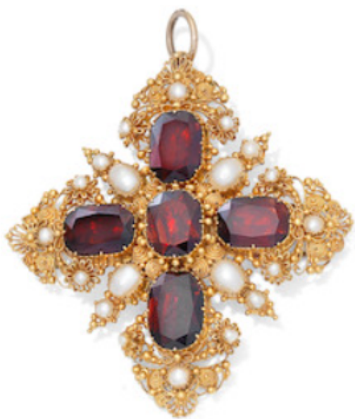
Bonhams cross pendant

The Twelve Days start on the 25 th December, and in keeping with the festive red and religious aspect of the celebrations, an early 19 th Century garnet and pearl cannetille cross pendant, which sold at Bonhams for £1,500.