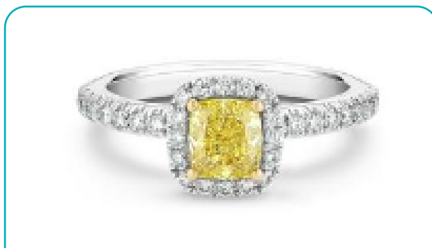
De Beers Aura ring

On the 30 th , one will have a quiet night in before the New Year celebrations. It could be a night to remember and remind that wonderful person just how much you love them with a fancy coloured-diamond ring from De Beers. The below cluster ring is set with a 0.52ct fancy yellow diamond, VS1, within a surround and shoulder set with brilliant-cut diamonds and retails for £7,250.