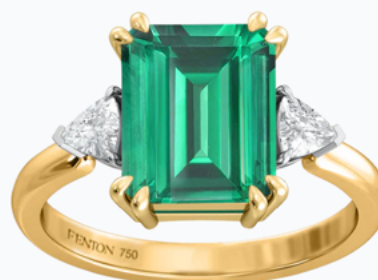
Emerald and diamond ring by Fenton