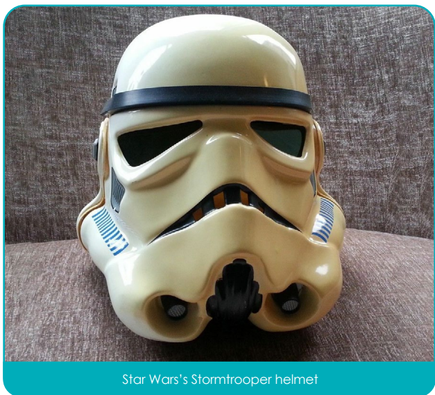
Star Wars's Stormtrooper helmet

What has recently come to my attention after looking at quite a few collections over the last few years is actually...Pokemon cards.