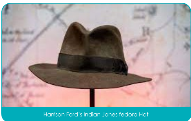
Harrison Ford's Indian Jones fedora Hat

Film ephemera has again rocketed, with specific auction houses now specialising on huge sales from major Hollywood studios and collectors. That means you can buy anything from Harrison Ford's infamous fedora hat (if you have the $300,000 that it recently achieved) to a helmet from a Stormtrooper, from the iconic Star Wars film series.