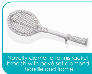
Novelty diamond tennis racket brooch with pave set diamond handle and frame

You'll also be needing a stylish watch and there is a plethora of choices endorsed by tennis stars. Roger Federer became a brand ambassador for Rolex in 2006 with what was, at the time the largest single endorsement for any professional athlete. He was contracted to Rolex for 10 years for which he received $15,000,000. Others now in the Rolex stable are Dominic Thiem for the Daytona; Garbiñe Muguruza with the DateJust and Jo-Wilfred Tsonga with the Milgauss. If you want to dress the part but favour other brands, Nadal wears a Richard Mille and Serena Williams an Audemars Piguet diamond outrage.