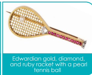
Edwardian gold, diamond, and ruby racket with a pearl tennis ball

Last year Ralph Lauren unveiled new uniforms for the court officials. The instantly recognisable polo shirt is now produced in wide navy blue and white stripes and they stated that they were combining the heritage of the brand with sustainable modern fabrics and modern silhouettes.