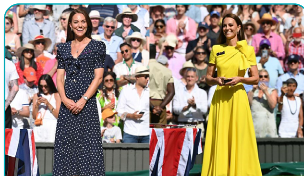
Kate Middleton Duchess of Cambridge at Wimbledon men's final