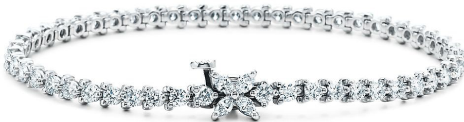
Tiffany Victoria diamond tennis bracelet which retails for £19,700

This style of line bracelet has been popular since the Art Deco period, but it was Chris Evert that brought it to such wide prominence and caused the change of name.